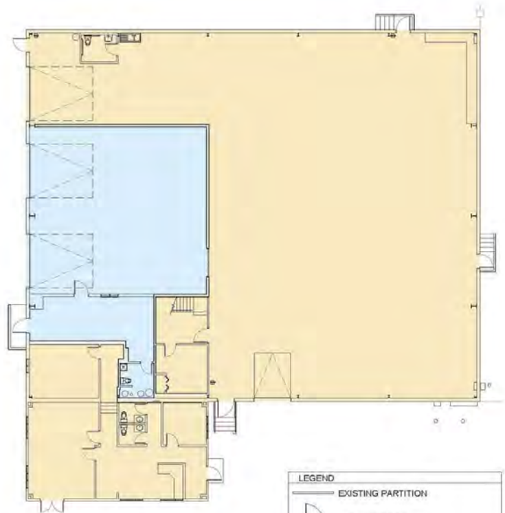
1 GROUND LEVEL